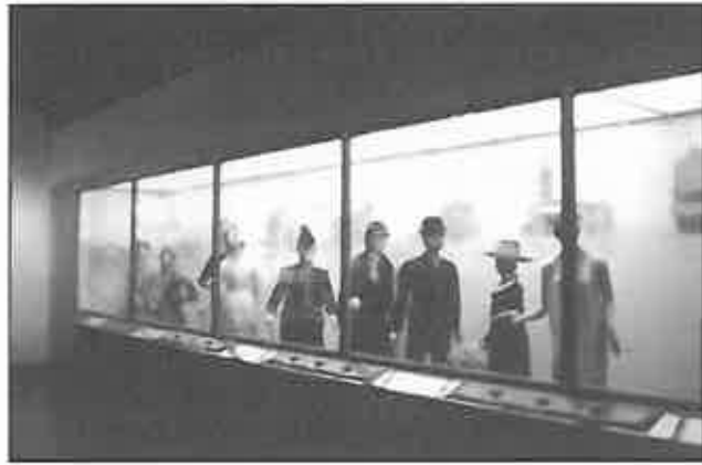
Figure 7: Natal Museum, Pietermaritzburg, South Africa

Another example, which makes the change of time even more apparent, is taken from a school-book. In a series of images of Greek sculptures, a genuinely historical development is visualized. (Figure 8) The aesthetically guided narration is charged with a historical sense construction that can easily be identified as the process of anthropomorphisation in Greek sculpture from the abstract to the concrete. This visual presentation of a historical development transports the traditional educational package of the ancient world, namely its humanization of people.