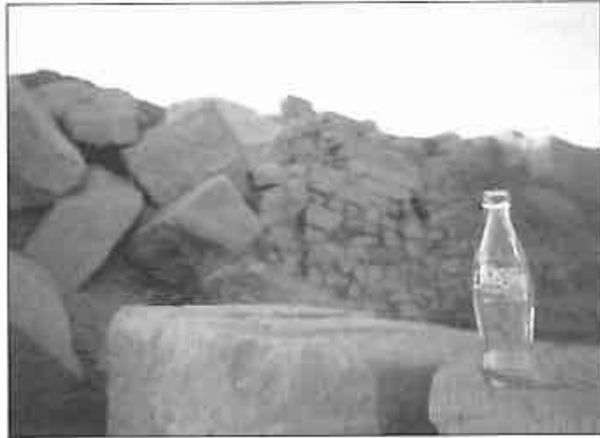
Figure 4: Coca-Cola bottle among the ruins of Ancient Egypt Photograph: Jörn Rüsen, 1987

aesthetic level. Examples which prompt the making of historical sense can be found everywhere. These can take the form of accidental constellations, such as when a tourist observes a Coca-Cola bottle on top of an ancient relic, for example. (Figure 4) These constellations can also be strategic, as in commercials (Figure 5), or as consciously aesthetic performances. (Figure 6)