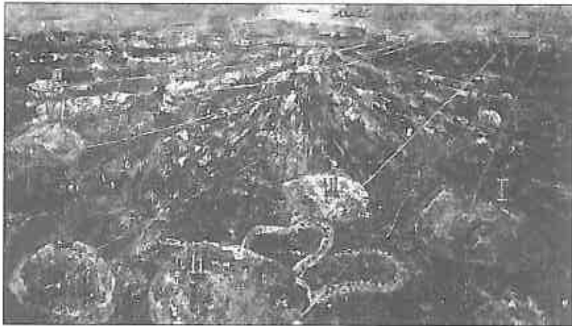
Figure 12: Anselm Kiefer, "The Order of the Angels" (1983/84) Art Institute of Chicago

absence of sense in a sense-bearing way. This is true for Kafka's novels as well as for many paintings, such as the works of Anselm Kiefer, to mention an example. (Figure 12)