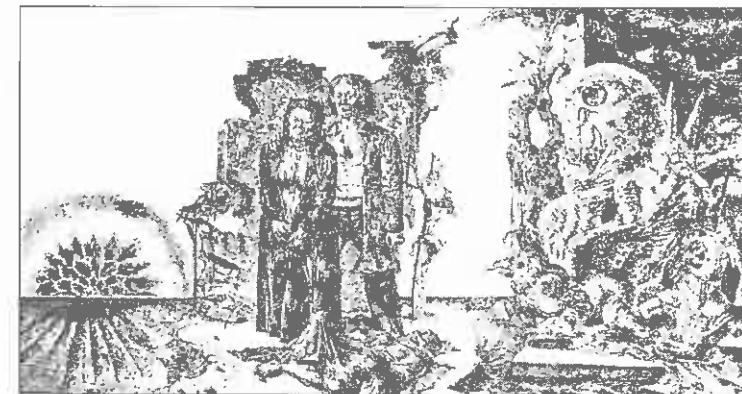
Figure 10: Heinz Plank, "Knowledge and Experience – the Wealth of Humankind" (1974) Sammlungs- und Dokumentationszentrum Kunst der DDR, Beeskow