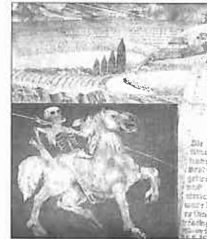
Figure 9: Werner Hennig, "Looking Back" (1975) Sammlungs- und Dokumentationszentrum Kunst der DDR, Beeskow

Although history as a narrative bridge between times becomes visible in these examples, its power of generating historical sense is rather weak. There are pictorial representations, however, which explicitly thematize the meaningful historical relation between historical periods and therefore possess a strong historical sense. I am referring to three examples from an East German collection of etchings entitled "On the 450th anniversary of the German Peasants' War" (1975): Werner Henning's "Looking Back" ( Rückblick ), Heinz Plank's "Knowledge and Experience – the Wealth of Man" ( Wissen und Erfahrung – der Reichtum des Menschen ), and Alexandra Müller-Jontschewa's "Renaissance Landscape in Central Germany" ( Mitteldeutsche Renaissancelandschaft ) give a clear but mostly ideological message of historical sense. (Figures 9, 10 and 11)