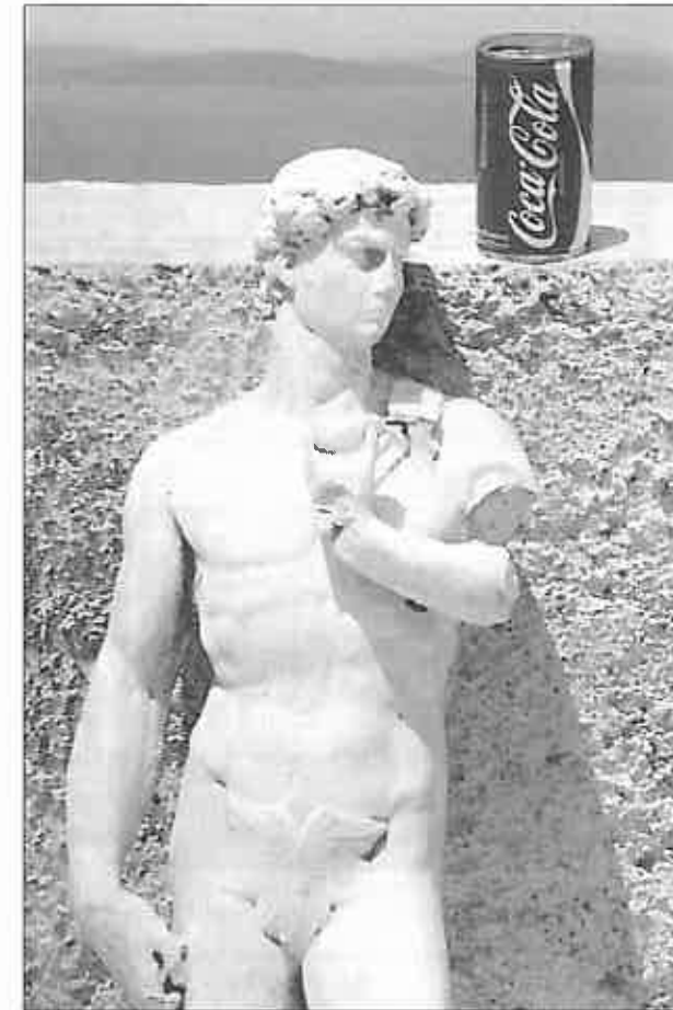
Figure 6: Postcard of 'Greece'. Edition Dimitri Haytalis, 1986

Just as the experience of temporal difference as a necessary presupposition for historical perception can be aesthetically formulated, it can also form the starting point for the bridging of historical eras on a visual level.