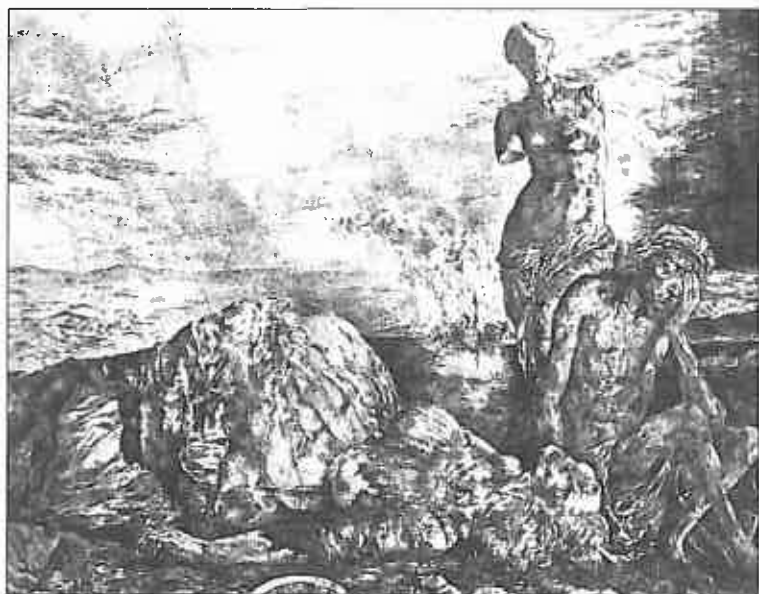
Figure 11: Alexandra Müller-Jontschewa, "Renaissance Landscape in Central Germany" (1975) Sammlungs- und Dokumentationszentrum Kunst der DDR, Beeskow

Vividly, Henning's piece presents as progress the historical sense that connects past and present. Plank's piece is somewhat more differentiated: it presents progress as a man-made development. Yet, the image of history as a learning process, as suggested by the title, is not visible and must be added meta-aesthetically and thus with a didactically raised forefinger. Finally, Müller-Jontschewa's piece, a composition in which the figures represent different eras, accentuates a remarkable kind of historical sense generation, that of mourning.