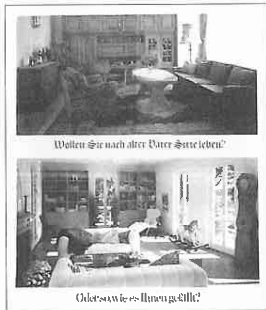
Figure 5: Furniture advertisement. The inscription states: "Would you like to live according to old customs? Or in the way you would like to?" Die Zeit, 24 October 1986