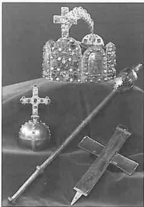
Figure 2: Insignia of the Holy Roman Empire, Vienna

Remains which signify tradition symbolize a certain time or era. In their concrete presence, they stand for the era in the past which they represent. The coronation insignia on view in the Hofburg of Vienna (from the second half of the tenth century), for example, point to the Middle Ages. (Figure 2) In our historical memory of symbols, a crown represents a different time, mainly the Middle Ages, and a different system of power, that of kings and emperors and not of presidents and prime ministers.