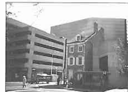
Figure 3: Declaration (also Graff) House, Philadelphia Photograph: Jörn Rösen, 1988

Is there an aesthetic way of creating a narrative of historical meaning that transforms the past into history? The experience of temporal difference is a necessary condition of historical interpretation which can be easily realized aesthetically. This difference is not a simple chronological one between the 'earlier' and the 'later', between the past and present, but a qualitative temporal alterity. It is a very simple fact that the 'then' is different from the 'now' in its mode of temporality. Therein lies the crucial point. This difference can be perceived through a genuinely visual experience. Take, for example, the famous building in Philadelphia in which Thomas Jefferson wrote the Declaration of Independence and which is visually very different from the adjacent modern car park. (Figure 3) The two buildings stand for two different eras