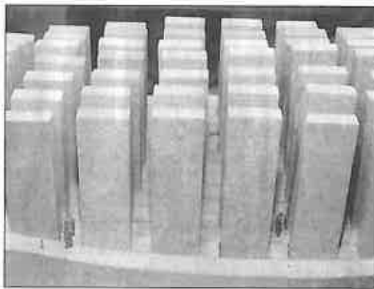
Figure 13: Richard Serra and Peter Eisenman, First Draft for the Monument to the Murdered Jews of Europe Die Zeit , 21 November 1997, p. 64

Peter Eisenman and Richard Serra's proposal for the Monument to the Murdered Jews of Europe (Figure 13) represents this sense-bearing absence of sense. 6 Its power of persuasion comes at a price: its meaning is meta-historical and it does not refer to any temporal sequence of events.